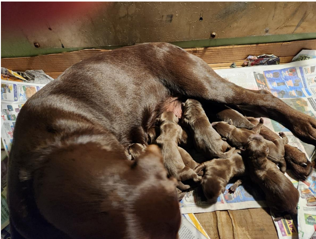
The 11 newest members of the Bowker family.